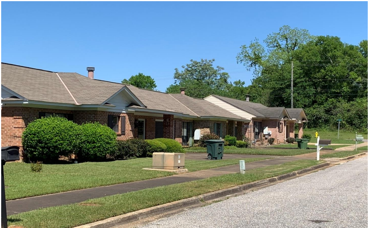
Ashton Place Garden Homes