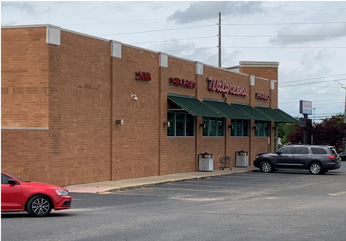
Walgreens in walking (or golf cart) distance