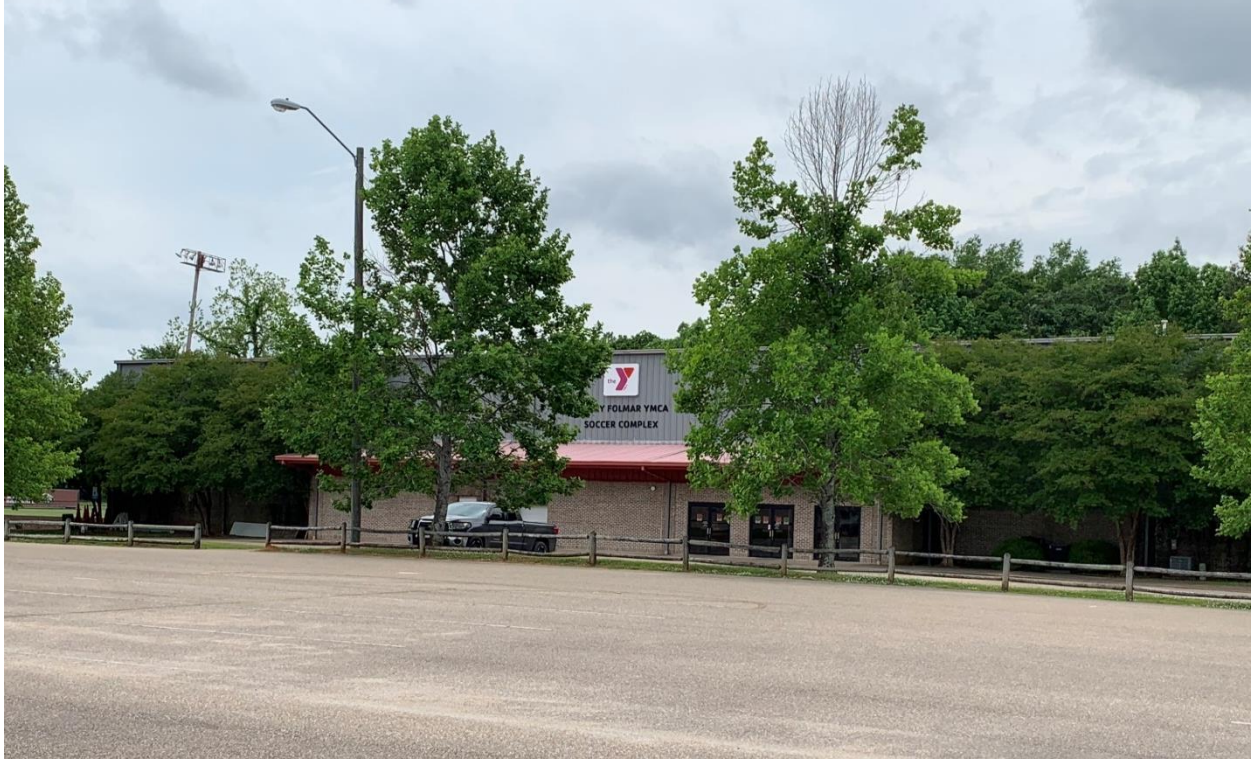
Emory Folmar YMCA