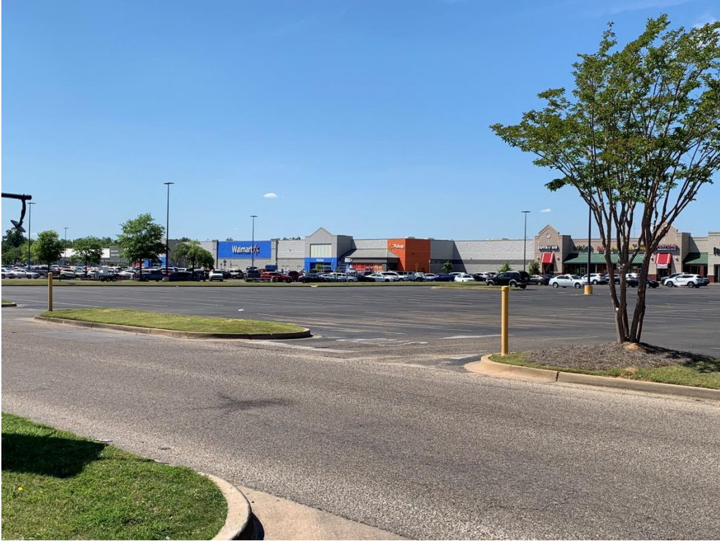
Walmart across from site