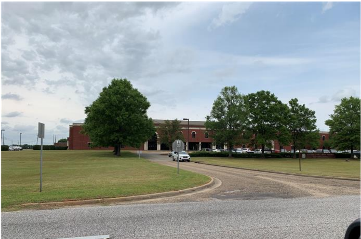
Winton Blount U.S. Post Office