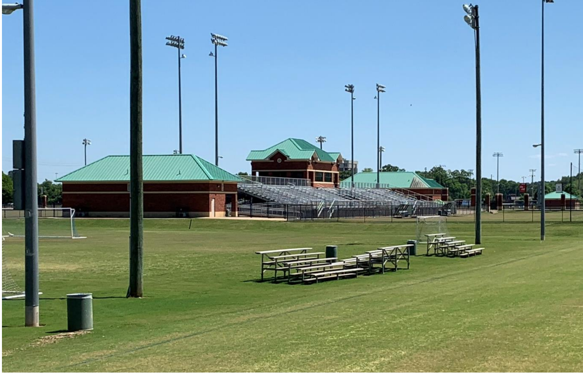
Emory Folmar Soccer Complex