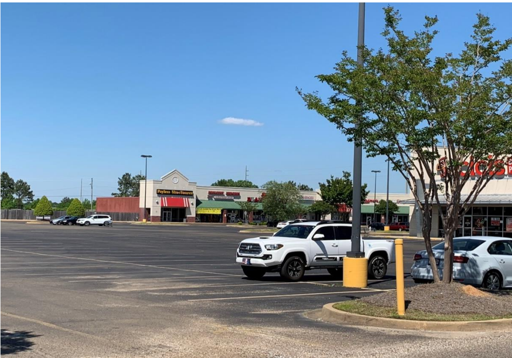
Dozens of national retailers and restaurants