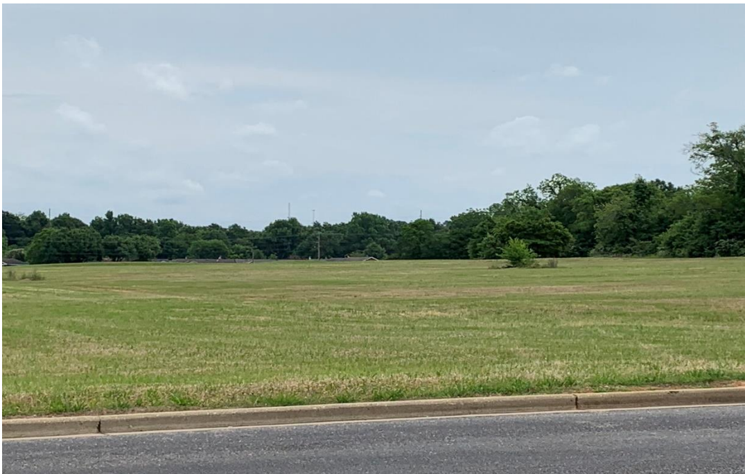
100% useable land