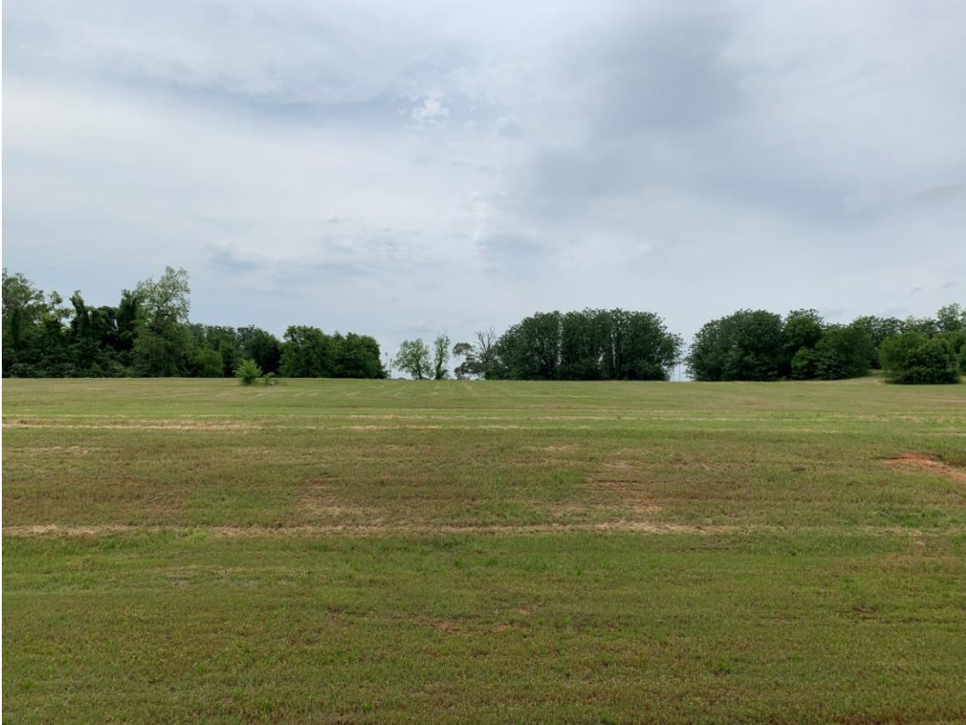
High and dry. Excellent soil.