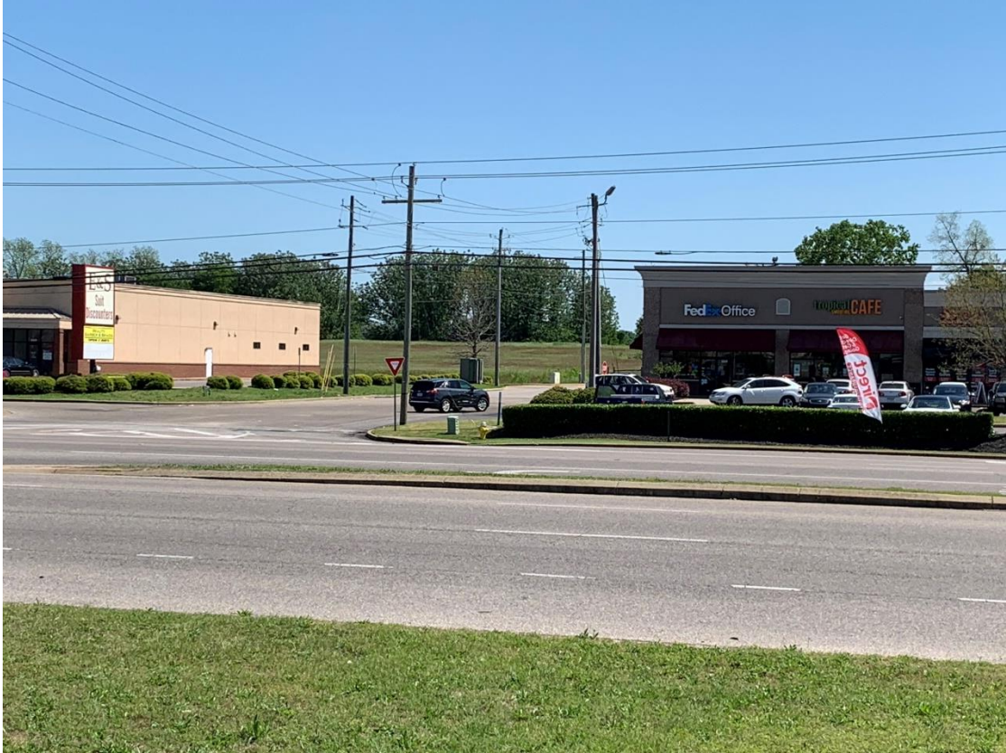
FedEx adjacent to site