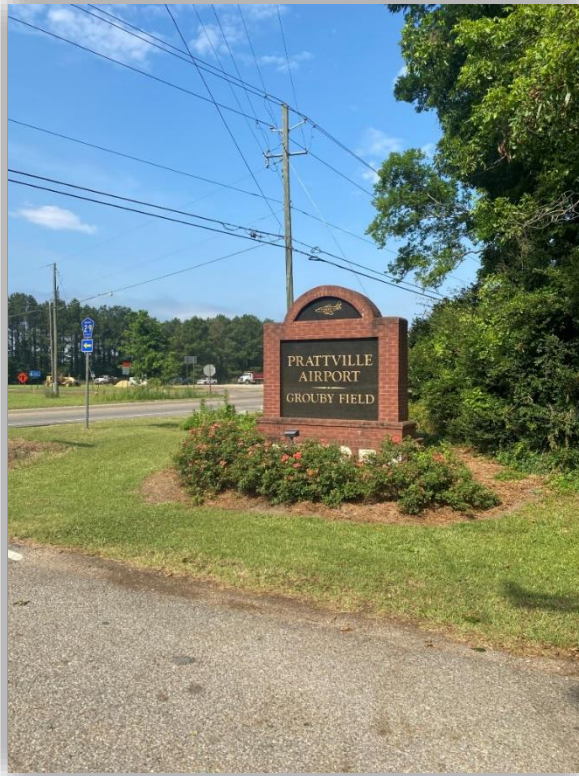
Entrance to Grouby Airport Rd