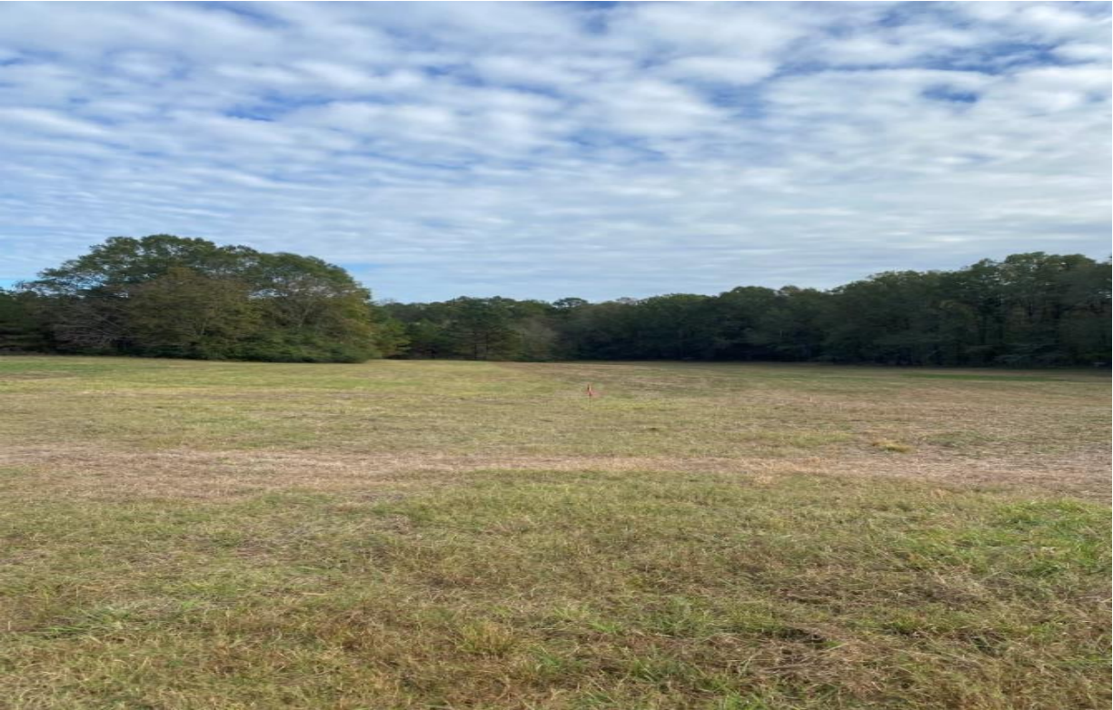
Lot 3 12.93 acres