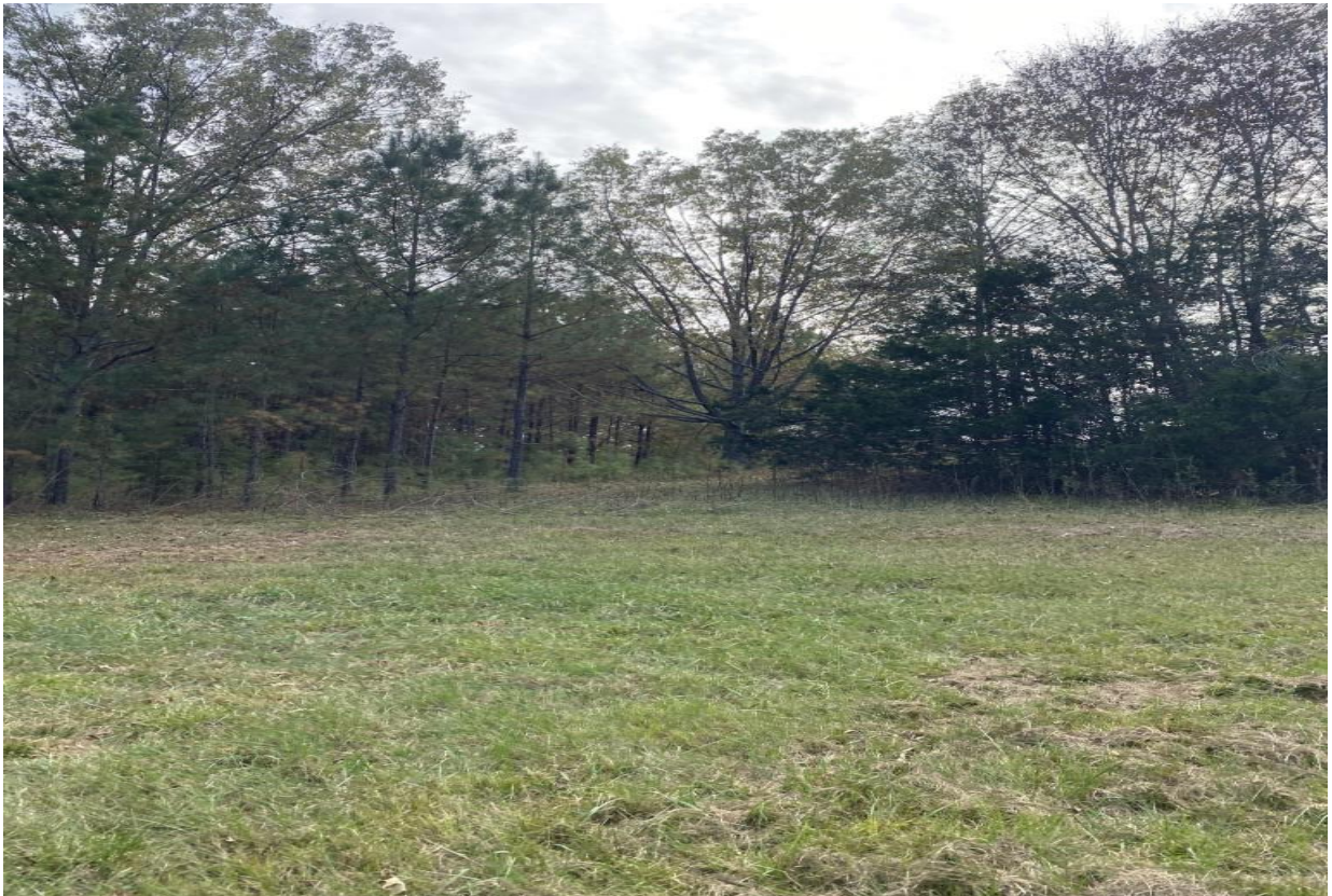
Lot 3 12.93 acres