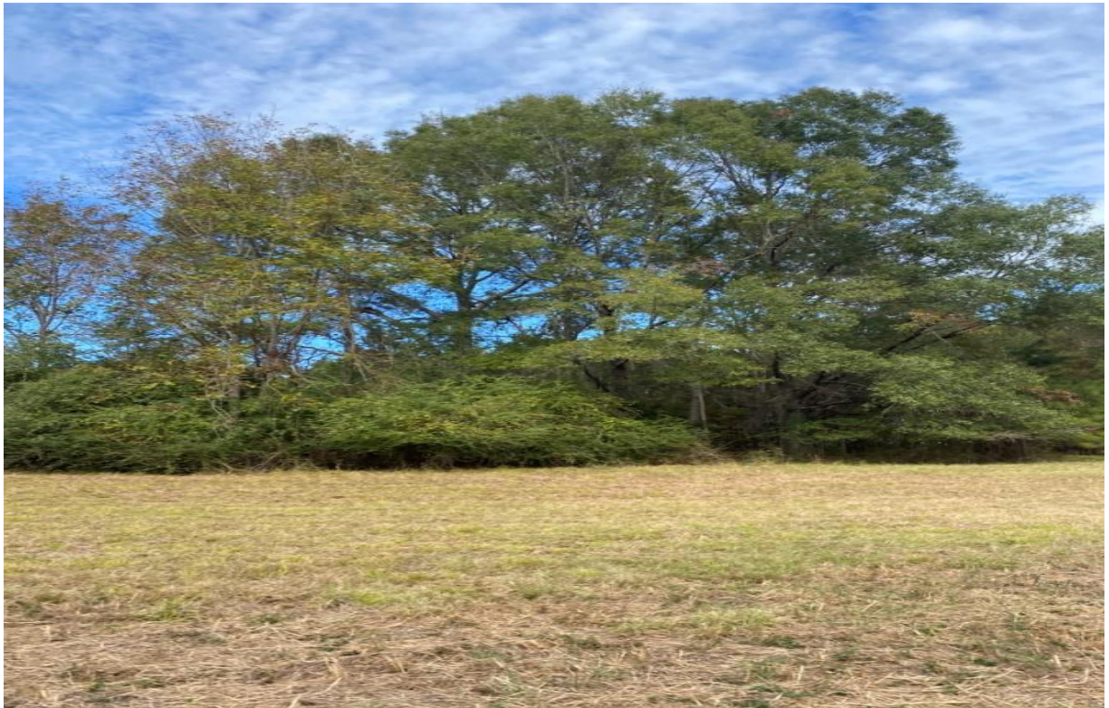
Lot 3 12.93 acres