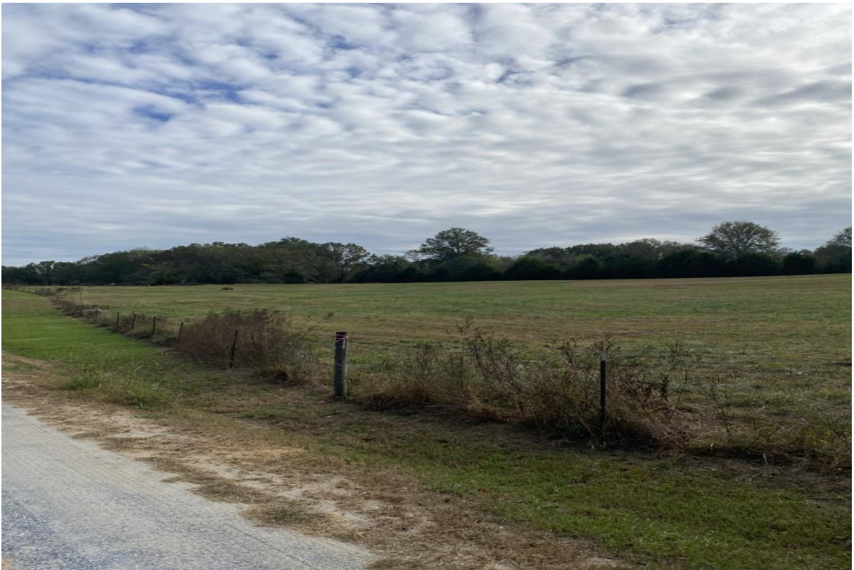
Lot 2 6.68 acres