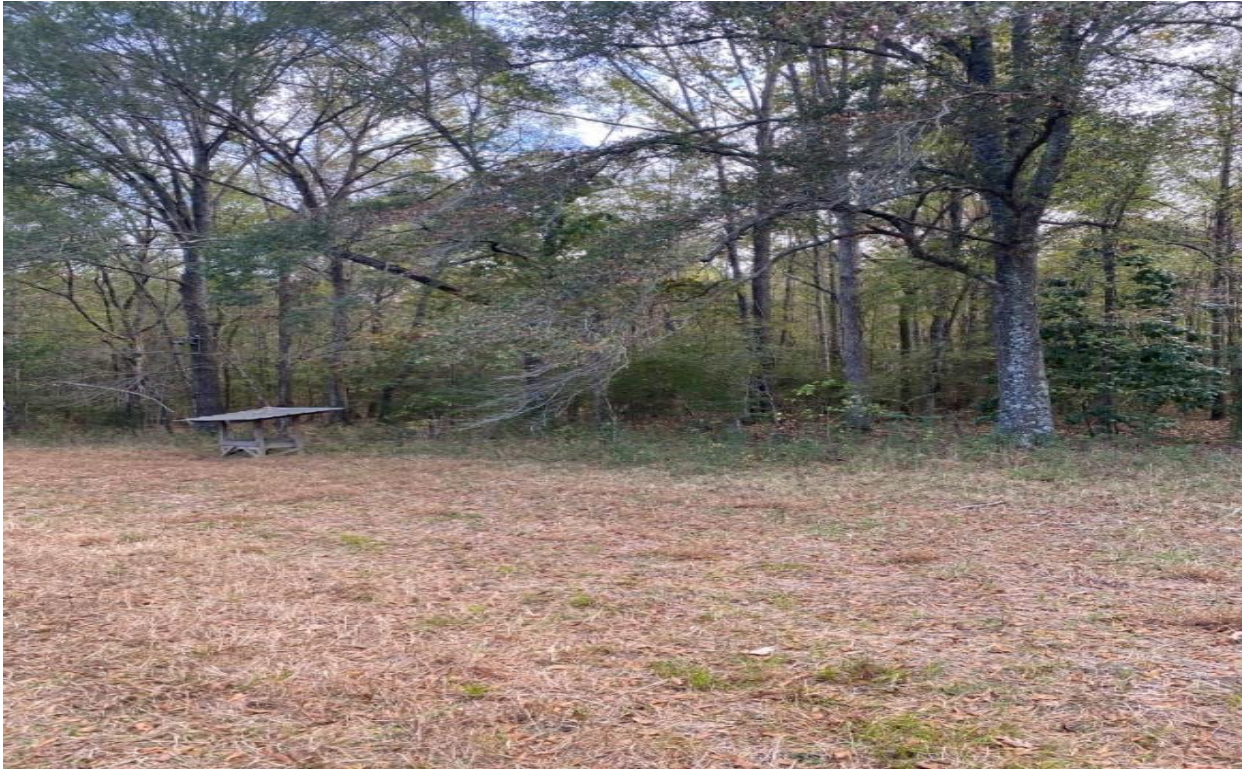
Lot 3 12.93 acres