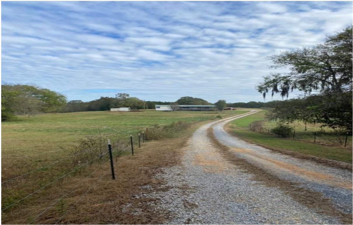
Lot 1 Sold