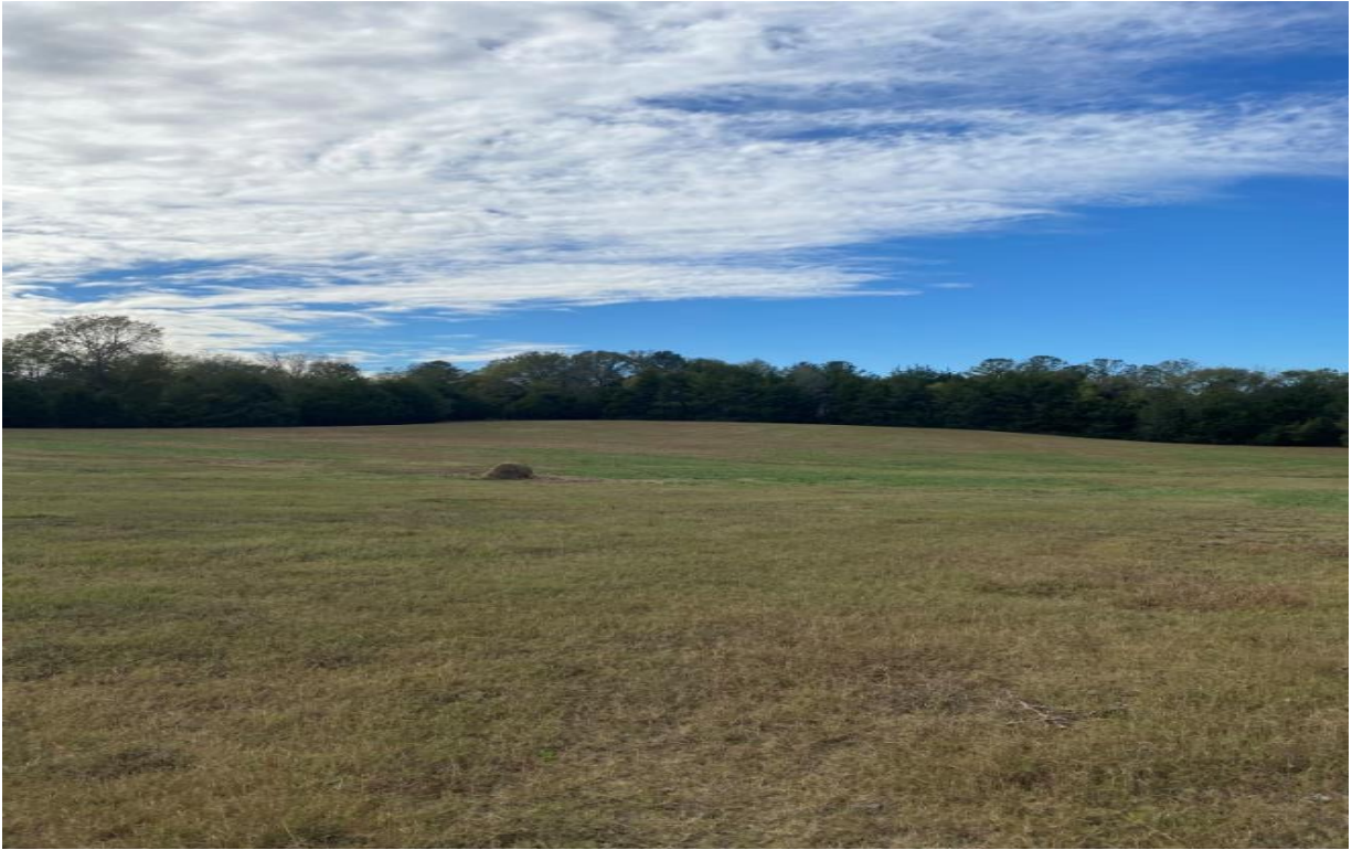
Lot 2 6.68 acres